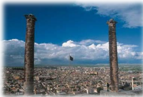
Visit to Abraham's Cave