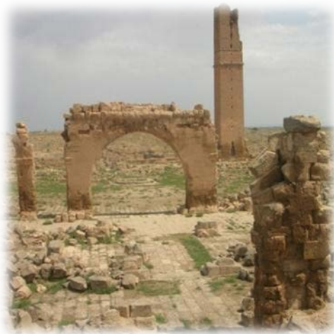
Visit to Harran, the location of the world's first university