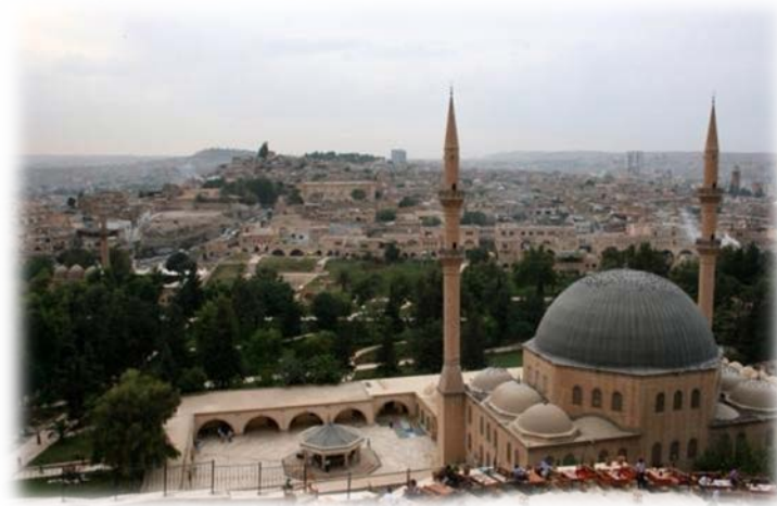
Visit to Harran, the location of the world's first university